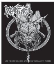
OF DEATHBLADES AND BLOODSOAKED PATHS